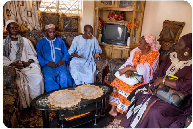
Women community leaders meet with local religious leaders to discuss issues relating to women's rights, reproductive health and family planning.

Some social norms change quickly, such as expectations and rules around the increasing use of mobile phones. Others are more persistent, such as the household roles that men and women are expected to play. Experts note that social norms can be particularly powerful in influencing behaviors among marginalized populations. For example, young people may be denied participation in critical life decisions in communities where adults are given decision-making power over adolescents. 3 Individuals with more resources, such as higher education or economic status, are more likely to engage in