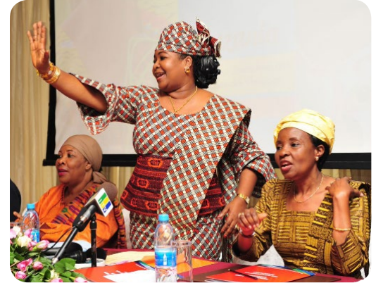
2012, Humphreath's International Limited

Laws, regulations, codes, and policies affecting the operations of a health system range from those governing import duties and budget allocations, tenders, and purchases of contraceptives at ministerial levels to those influencing how health personnel at the primary care level spend their time and the quality of treatment clients receive at the facility level. Often, barriers to accessing high-quality health services have their roots in non-existent, inadequate, or conflicting policies (Cross et al., 2001). Tables 1-3 provide examples of three levels of policies from Asia, Latin America, and sub-Saharan Africa.