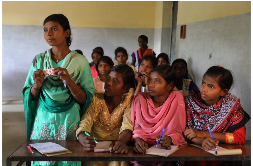
Unmarried girls, ages 15 to 19, attend a Pathfinder International training about adolescent sexual and reproductive health.