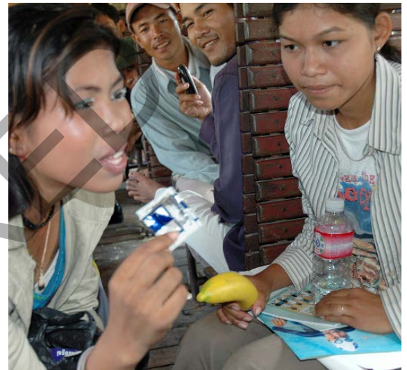
In Cambodia, an NGO worker explains condom use to passengers on the Battambang-Phnom Penh train route using comedy and drama to inform young people about HIV/AIDS. Using such techniques in health communication programs engages people’s emotions while motivating them to make healthy choices.