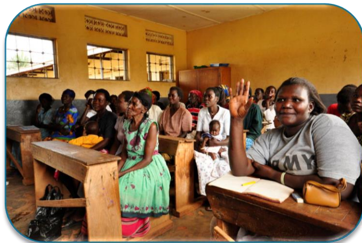
Women attend a literacy class in Gulu, Uganda, as part of a microfinance program sponsored by Women's Global Empowerment Fund.

The intensity of training varied. In Bangladesh, girls received 44 hours of life-skills training plus 100 hours of either education, gender-rights awareness, and/or livelihoods training over 18 months, whereas the program in the Dominican Republic consisted of 225 hours of training (Population Council, 2016). Sample sizes ranged from 100 to 10,000 among the five studies. Only two programs included health components; one focused on increasing knowledge (for example, about HIV and pregnancy) and reducing risky behaviors such as sex without condoms and forced sex (Bandiera et al., 2012) and the other included an HIV prevention component (Rotheram-Borus et al., 2012). Three of the five studies measured condom use. The two programs in Uganda, which included a health component, documented an increase in condom use (Bandiera et al., 2012; Rotheram-Borus et al., 2012) as well as other positive effects. The program in Malawi found no significant effects on condom use (Cho et al., 2015).