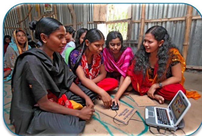
Adolescent girls learning how to use a computer in Gondohali village, Bangladesh.

This brief summarizes the current evidence on interventions used by family planning programs that sought to improve women's or girls' economic empowerment and that measured key family planning outcomes. The interventions cluster in three primary focus areas: