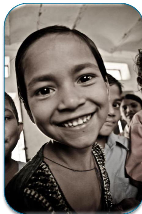
A student at a government-funded free school in Harvana, India.

Another program in Ethiopia sought to increase the age at marriage among adolescent girls by providing access to literacy, numeracy, and livelihood training; financial support for school; and a goat for the girl and her family if her