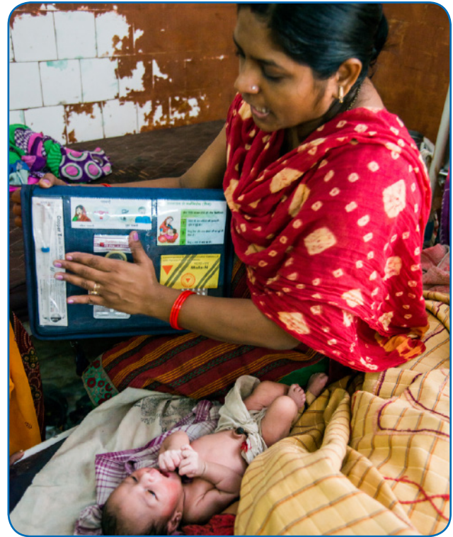
Mothers and their newborn children in the post natal ward at the district hospital in Arrah, Bihar.

Offering modern contraception services as part of care provided during childbirth increases postpartum contraceptive use and is likely to reduce both unintended pregnancies and pregnancies that are too closely spaced. 1,2 Unintended and closely spaced births are a public health concern as they are associated with increased maternal, newborn, and child morbidity and mortality. 3-5 After a live birth, the recommended interval before attempting the next pregnancy is at least 24 months, based on a consultation convened by the World Health Organization (WHO), in order to reduce the risk of adverse maternal, perinatal, and infant outcomes. 6 Despite this evidence, 61% of women are not using effective contraception within 24 months postpartum to avoid an unintended pregnancy. 7