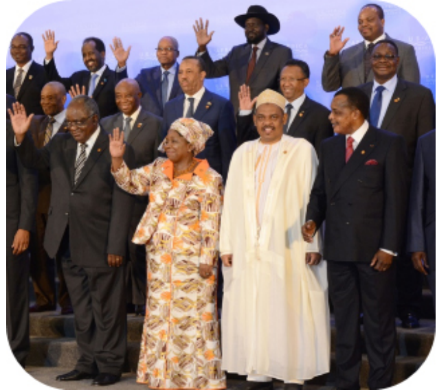
African Leaders at Summit, August 6, 2014

Demonstrable commitment to family planning strengthens the enabling environment in which programs and policies are implemented. Countries such as Indonesia, Mexico, and Turkey have longstanding commitments to family planning, as demonstrated by their use of domestic resources, work toward strengthening systems at subnational levels, and increases in contraceptive prevalence rates (Alkenbrack & Shepherd, 2005; Ozvaris et al., 2004; Seltzer, 2002). Regardless of past performance, countries can experience stagnation as their commitment to family planning lags over time (Putjuk, 2014).