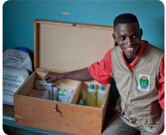
A community health worker in Togo with his lockbox of medication and supplies.

Integrating CHWs into the health system is one of several proven “high-impact practices in family planning” (HIPs) identified by a technical advisory group of international experts. A proven practice has sufficient evidence to recommend widespread implementation as part of a comprehensive family planning strategy, provided that there is monitoring of coverage, quality, and cost as well as implementation research to strengthen impact (HIPs, 2014). For more information about other HIPs, see https://www.fphighimpactpractices.org/overview .