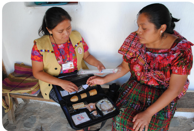
A health promoter in El Quiché, Guatemala, discusses contraceptive method options with a family planning user.

Programs that link CHWs with clinic-based service delivery can be cost-effective. Cost and cost-effectiveness of CHW programs vary depending on the program setting, worker compensation, maturity of the program, strategies used for training and supervision, and the number of clients served (FRONTIERS et al., 2002). A review of family planning programs in 10 developing countries found that programs that combined CHWs with clinic-based service delivery were more cost-effective than either clinic-based or CHW programs alone (see Table 1).